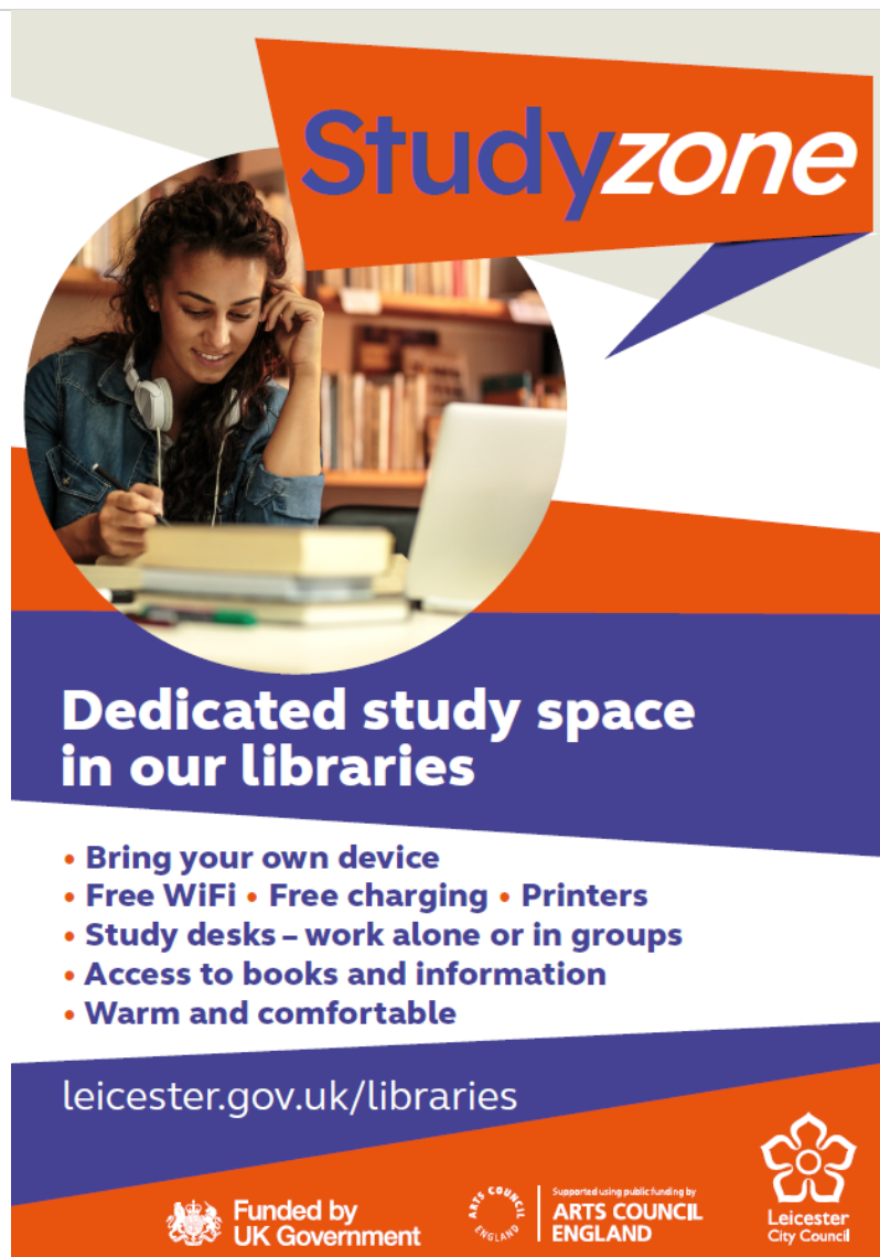
Study Zones promotional poster, August 2024