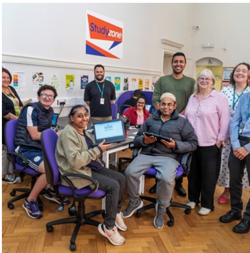
Study Zones launch with the "Values" group , August 2024

3.14 The Study Zones scheme was formally launched in August 2024 by the "Values" group at the Central Library. The group meet every week and are using the new facilities to learn more about the range of online library resources available, including e-newspapers and e-magazines. The group leader said "we find that meeting up to study together really helps us, but we need a large enough space that is quiet where we can plug in our laptops and concentrate properly. The new study zones are going to be ideal for us"